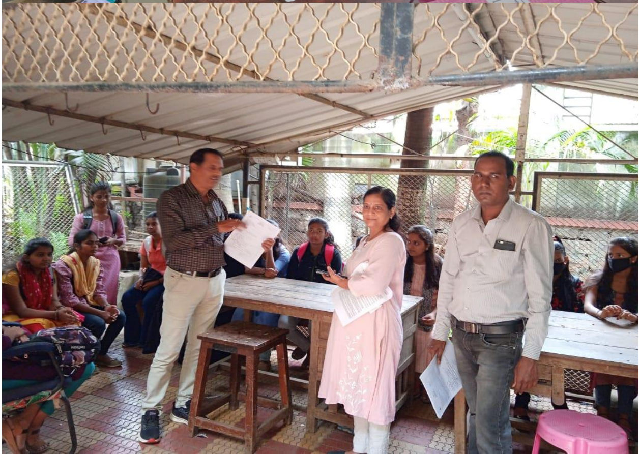
निवडणूक साक्षरता मंचातर्फे मतदार जनजागृती मोहीम राबवताना