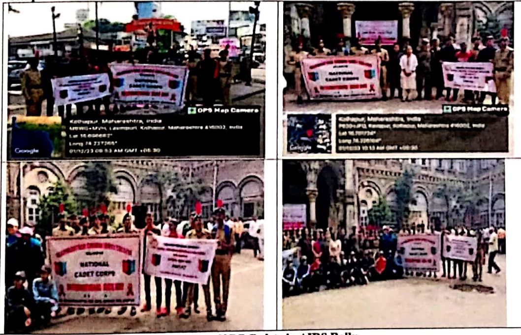
GKG College NCC Cadets In AIDS Rally

Outcome: By this event students came to know, The World AIDS day, which has been observed every year starting from 1988, has focused on creating an awareness among the people of AIDS and educate them not to discriminate against people who have been affected with HIV.