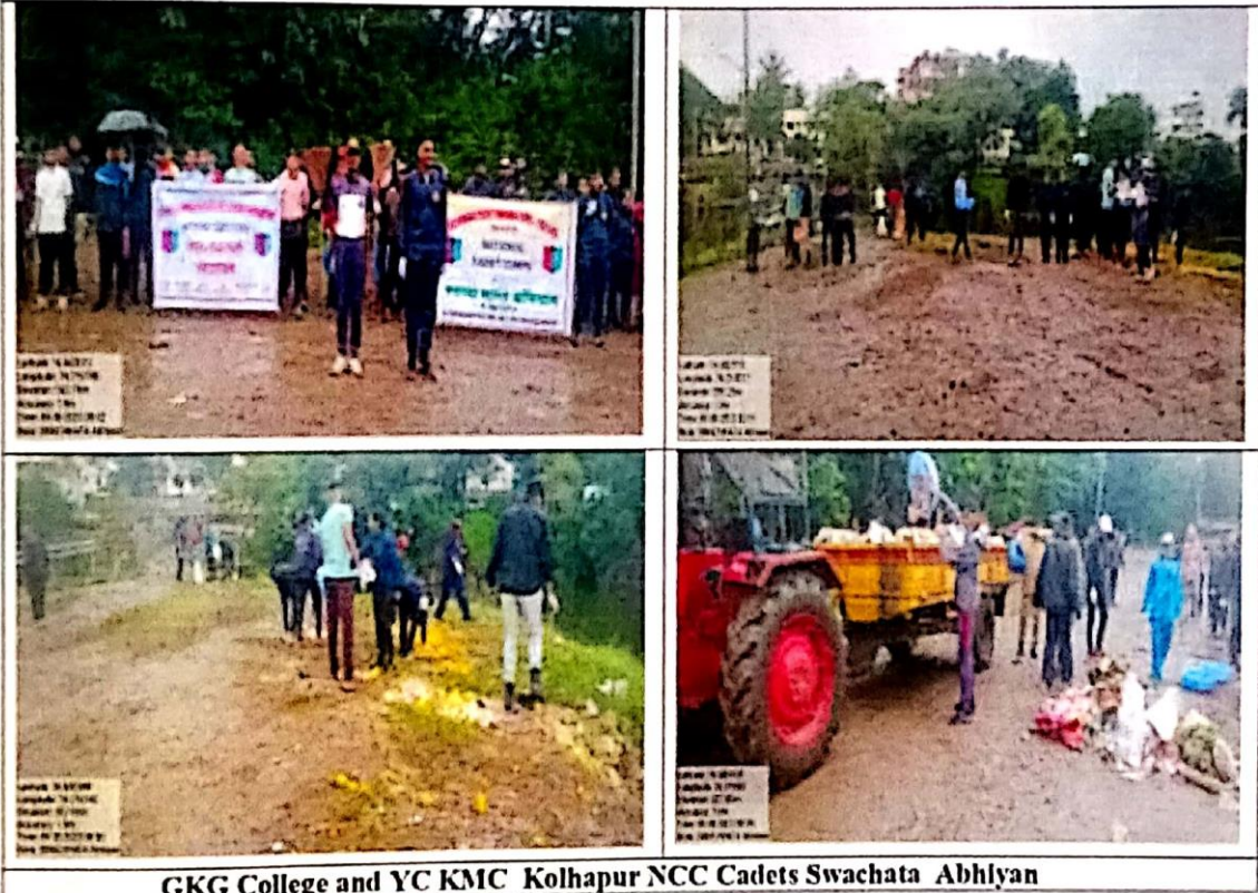
GKG College and YC KMC Kolhapur NCC Cadets Swachata Abhiyan