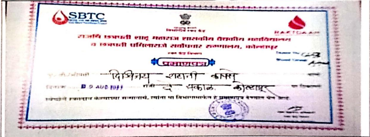
GKG College NCC Cadets In Blood Donatlon Camp

Outcome: By this event students came to know,