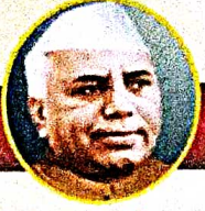
Hon. Yashwantrao Chavansaheb Founder