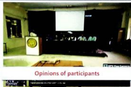
Opinions of participants

Title of Activity : One day Workshop on " E-Learning, E-Resources in Academic Library " Date : 19 th January 2024 Organized by : Department of Library Photo Gallery : Valedictory Ceremony- Distribution of certificates to participants