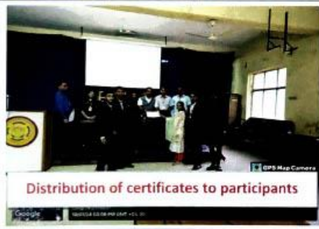
Distribution of certificates to participants