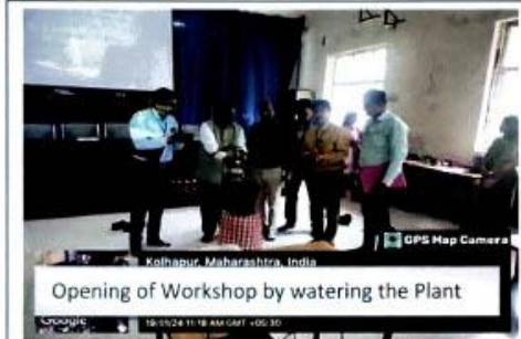
Opening of Workshop by watering the Plant

Title of Activity : One day Workshop on " E-Learning, E-Resources in Academic Library " Date : 19 th January 2024 Organized by : Department of Library Photo Gallery : Inauguration Function