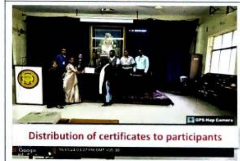
Distribution of certificates to participants