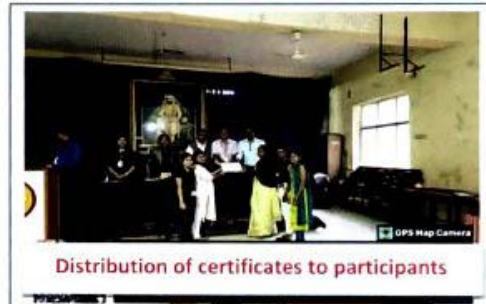
Distribution of certificates to participants